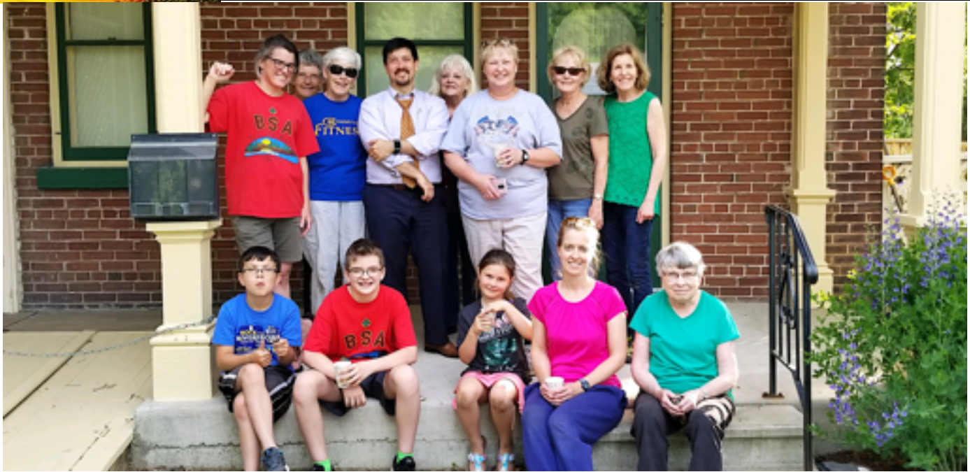
The “Schlegelmilch House Mulchers”