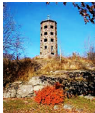
Enger Tower & Gardens