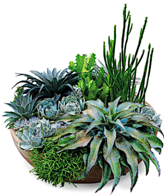
A lovely container planting from Fine Gardening’s e-newsletter