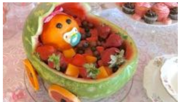
And, here is a bit of whimsy for your table decoration and fruit salad bowl.